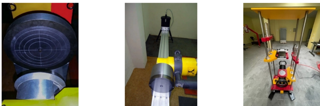
Fig. 2. Inspection Body and Calibration Laboratory in MULTITEST LTD, accredited by EA “BAS” to perform functional fitness verification of NDT equipment and calibration of test equipment.